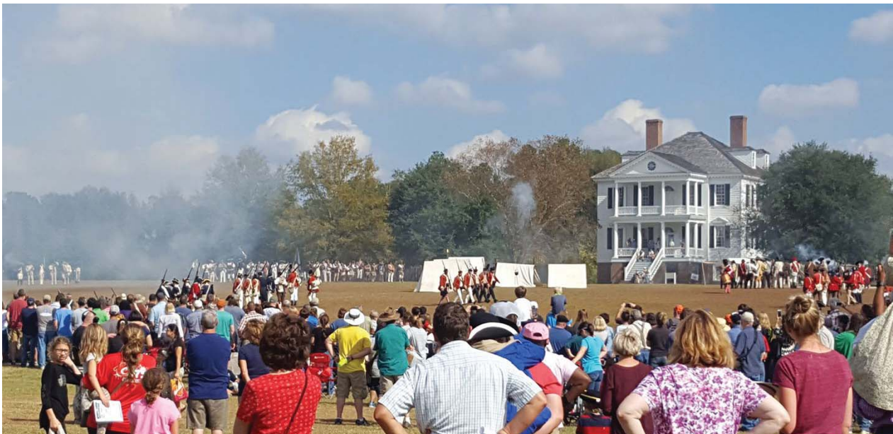
REVOLUTIONARY WAR FIELD DAYS