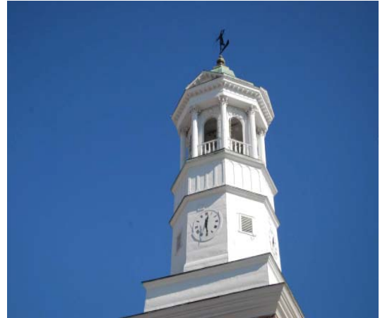
KING HAIGLAR OPERA HOUSE TOWER, c. 1886

The City of Camden created the Historic Landmarks Commission to help protect, preserve, and enhance the distinctive architectural and cultural heritage of the City as part of the public interest. Using a Historic Resources Survey that inventoried eight square miles and more than 860 properties, the Commission has created a list of locally designated historic properties within the City that includes more than 200 properties and eight parks. Any demolition, new construction, alteration, modification, or addition to an identified historic property requires a Certificate of Appropriateness from the Historic Landmarks Commission.