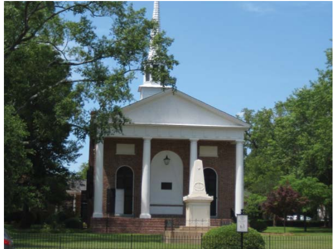
BETHESDA PRESBYTERIAN CHURCH, c. 1822

National Register listings can be achieved for larger historic districts that contain broader areas of multiple historic properties that have collective significance, for individual properties that meet the criteria, and for landmark sites that represent historical significance at a level greater than local and regional interest. The property must be significant under one or more of four criteria: 1) associated with events that have made a significant contribution to the broad patterns of our history; 2) associated with the lives of significant persons in our past; 3) embodies the distinctive characteristics of a type, period, or method of construction, or that represent the work of a master, or that possess high artistic values, or that represent a significant and distinguishable entity whose components may lack individual distinction; or 4) yields, or may be likely to yield, information important to prehistory or history. Historic districts can be designated to protect larger areas of historic properties and landscapes from adverse impacts of development. National Register criteria for historic districts require that the majority of the components comprising a district’s historic character have integrity even though they may be individually undistinguished. There are three historic districts in the City (Table 6-1 and Map 6-1).