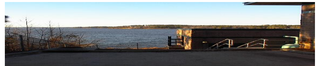
The Catawba River basin is the water source for many water treatment facilities in North and South Carolina. When enjoying recreational activities. . . . LET'S KEEP IT CLEAN!

If present, elevated levels of lead can cause serious health problems, especially for pregnant women and young children. Lead in drinking water is primarily from materials and components associated with service lines and home plumbing. The City of Camden is responsible for providing high quality drinking water, but cannot control the variety of materials used in plumbing components. When your water has been sitting for several hours, you can minimize the potential for lead exposure by flushing your tap for 30 seconds to 2 minutes before using water for drinking or cooking. If you are concerned about lead in your drinking water, you may wish to have your water tested. Information on lead in drinking water, testing methods, and steps you can take to minimize exposure is available from the Safe Drinking Water Hotline or at http://www.epa.gov/safewater/lead .